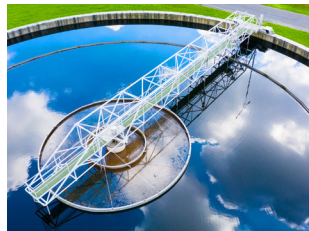
Water and wastewater profiling