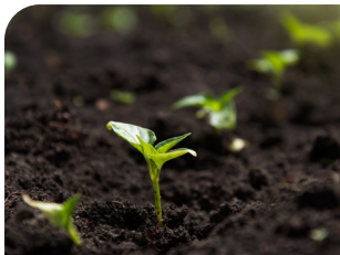
Analyzing population changes in soil

EcoPlates can be used in many applications including: