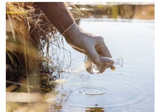
Monitoring bioremediation and effects of toxic chemicals