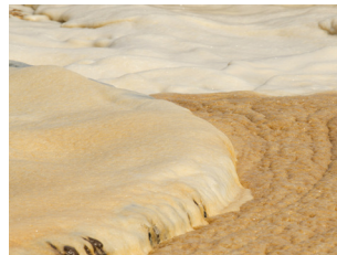
Activated sludge, compost & industrial waste testing